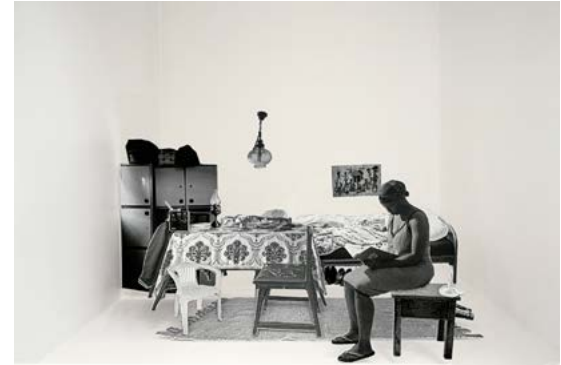
Her voice muffled by the soil, 2022 Inkjet print on cotton rag paper, 64 x 90 cm Edition of 5 + 2AP