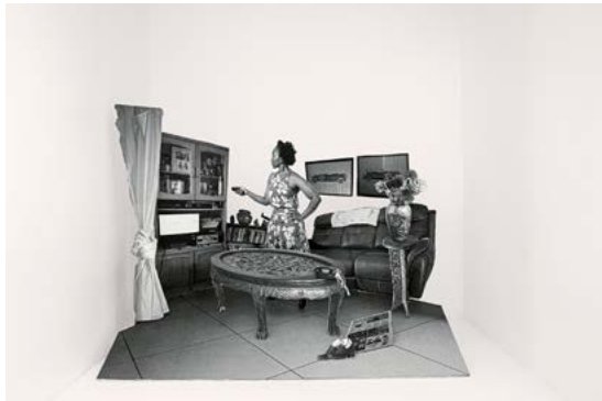
It was the most lingering, 2022 Inkjet print on cotton rag paper, 64 x 90 cm Edition of 5 + 2AP