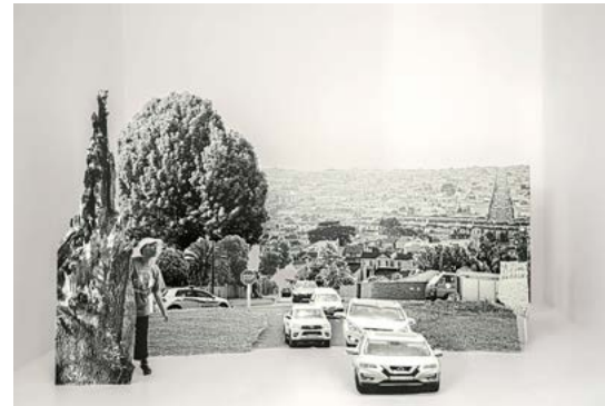
Lined the promenade across the street, 2022 Inkjet print on cotton rag paper, 64 x 90 cm Edition of 5 + 2AP