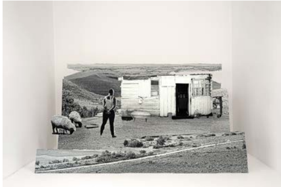
As if the darkness was calling out, 2022 Inkjet print on cotton rag paper, 64 x 90 cm Edition of 5 + 2AP

Staging Memories, 2022, Photography, Installation.