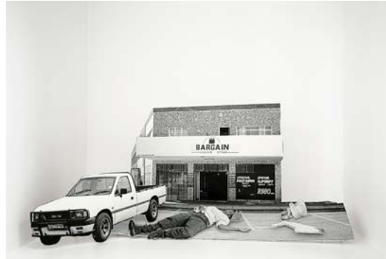
Blur in his eyes began to clear, 2022 Inkjet print on cotton rag paper, 64 x 90 cm Edition of 5 + 2AP