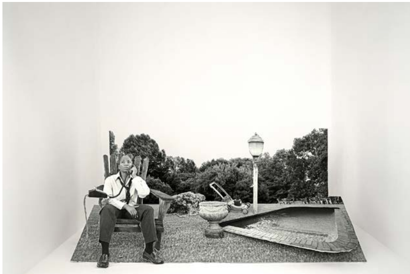
Staging Memories , Installation view at Musée Jenisch, Switzerland, (2022) of the work below

The work emphasizes the fabricated nature of history and memory: how the visualization of an event always induces an element of creation; an on-going construction.