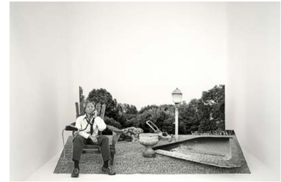
A great hope, postponed, 2022 Inkjet print on cotton rag paper, 64 x 90 cm Edition of 5 + 2AP