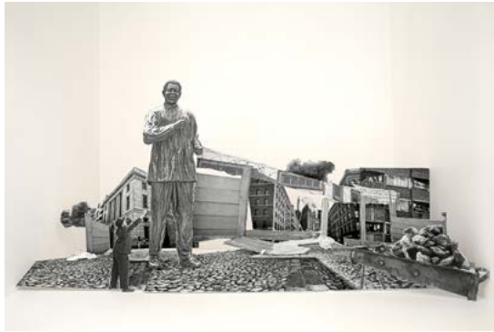
Untouched by the ancient caress of time, 2022 Inkjet print on cotton rag paper, 64 x 90 cm Edition of 5 + 2AP

Staging Memories, 2022, Photography, Installation.