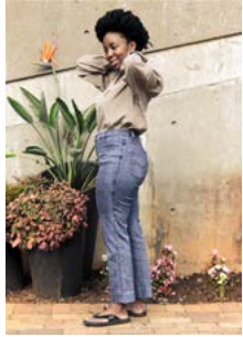
Habo Patience ka bokhathe I, 2013 Inkjet print on cotton rag paper, 42 x 29.7 cm Edition of 5 + 2AP

Ke Lefa Laka: Her-story, 2013, Photography.