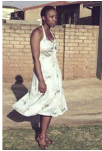
Ka mose wa malomo kwana 44 I, 2013 Inkjet print on cotton rag paper, 42 x 29.7 cm Edition of 5 + 2AP

Ke Lefa Laka: Her-story, 2013, Photography.