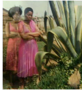
Ka 2-phisi yaka e pinky II, 2013 Inkjet print on cotton rag paper, 42 x 42 cm Edition of 5 + 2AP