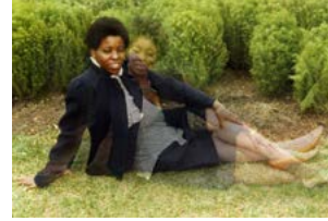
Tshimong ka hara toropo II, 2013, Inkjet print on cotton rag paper, 29.7 x 42 cm, Edition of 5 + 2AP