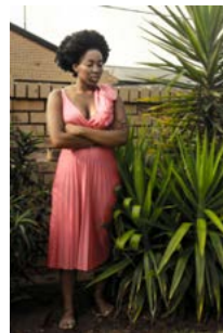
Ka 2-phisi yaka e pinky I, 2013 Inkjet print on cotton rag paper, 42 x 29.7 cm Edition of 5 + 2AP