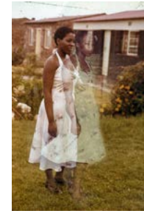
Ka mose wa malomo kwana 44 II, 2013 Inkjet print on cotton rag paper, 42 x 29.7 cm Edition of 5 + 2AP