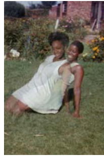
Ke dutse pela dipalesa II, 2013 Inkjet print on cotton rag paper, 42 x 29.7 cm Edition of 5 + 2AP