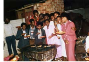
Kwana borayeng Phadima II, 2013 Inkjet print on cotton rag paper, 29.7 x 42 cm Edition of 5 + 2AP