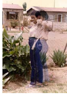
Habo Patience ka bokhathe II, 2013, Inkjet print on cotton rag paper, 42 x 29.7 cm, Edition of 5 + 2AP