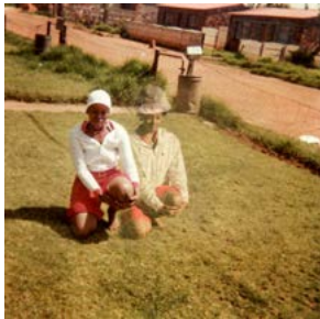
Boduto feela II, 2013 Inkjet print on cotton rag paper, 42 x 42 cm Edition of 5 + 2AP