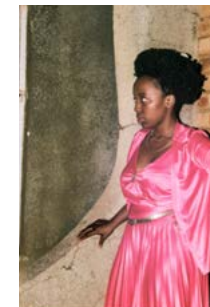
Ke monahano ke ntse ke le pating I, 2013 Inkjet print on cotton rag paper, 42 x 29.7 cm Edition of 5 + 2AP