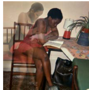
Ke bala buka ke apere naeterese II, 2013, Inkjet print on cotton rag paper, 42 x 42 cm, Edition of 5 + 2AP