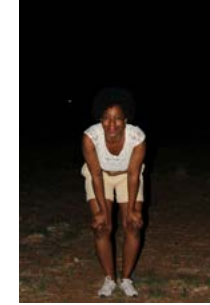
Ke tsamaya masiu I, 2013 Inkjet print on cotton rag paper, 42 x 29.7 cm Edition of 5 + 2AP