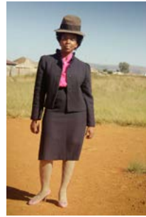
Re shapa setepe sa lenyalo I, 2013 Inkjet print on cotton rag paper, 42 x 29.7 cm Edition of 5 + 2AP