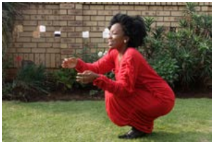
Setshwantso le ngwanaka I, 2013 Inkjet print on cotton rag paper, 29.7 x 42 cm Edition of 5 + 2AP