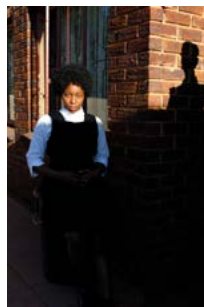
Ke eme ka diaparo tsa sekolo I, 2013 Inkjet print on cotton rag paper, 42 x 29.7 cm Edition of 5 + 2AP