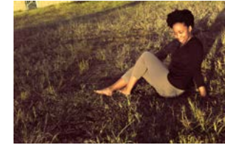
Jwang ba hae I, 2013 Inkjet print on cotton rag paper, 29.7 x 42 cm Edition of 5 + 2AP