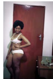
Ke le motle ka bulumase le bodisi I, 2013 Inkjet print on cotton rag paper, 42 x 29.7 cm Edition of 5 + 2AP