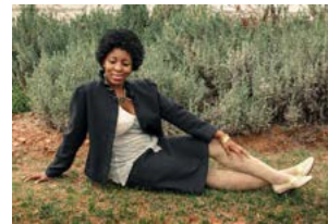
Tshimong ka hara toropo I, 2013 Inkjet print on cotton rag paper, 29.7 x 42 cm Edition of 5 + 2AP