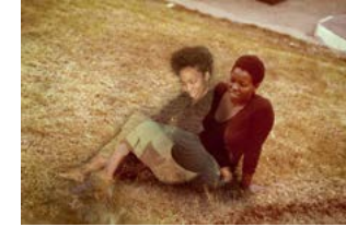
Jwang ba hae II, 2013 Inkjet print on cotton rag paper, 29.7 x 42 cm Edition of 5 + 2AP