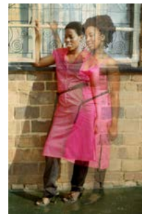
Setupung sa kwana hae II, 2013 Inkjet print on cotton rag paper, 42 x 29.7 cm Edition of 5 + 2AP