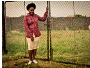
Hlakeng ya kereke I, 2013 Inkjet print on cotton rag paper, 29.7 x 42 cm Edition of 5 + 2AP