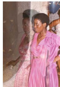
Ke monahano ke ntse ke le pating II, 2013 Inkjet print on cotton rag paper, 42 x 29.7 cm Edition of 5 + 2AP