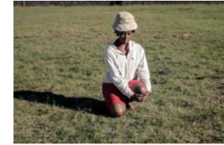
Boduto feela I, 2013 Inkjet print on cotton rag paper, 29.7 x 42 cm Edition of 5 + 2AP