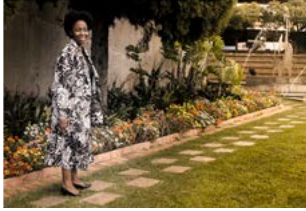
Lenyalong la Thobi I, 2013 Inkjet print on cotton rag paper, 29.7 x 42 cm Edition of 5 + 2AP

Ke Lefa Laka: Her-story, 2013, Photography.