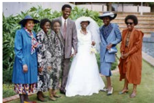
Lenyalong la Thobi II, 2013 Inkjet print on cotton rag paper, 29.7 x 42 cm Edition of 5 + 2AP