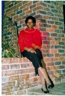
Kwana Germiston bosiu II, 2013 Inkjet print on cotton rag paper, 42 x 29.7 cm Edition of 5 + 2AP

Ke Lefa Laka: Her-story, 2013, Photography.