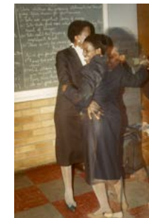
Re tantshetsa phaposing ya sekolo II, 2013 Inkjet print on cotton rag paper, 42 x 29.7 cm Edition of 5 + 2AP