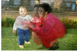
Setshwantso le ngwanaka II, 2013 Inkjet print on cotton rag paper, 29.7 x 42 cm Edition of 5 + 2AP

Ke Lefa Laka: Her-story, 2013, Photography.