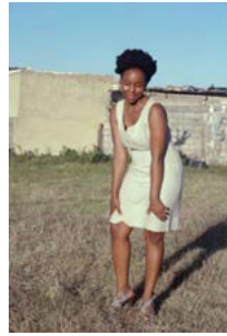
Ngwana o tshwana le dinaledi I, 2013 Inkjet print on cotton rag paper, 42 x 29.7 cm Edition of 5 + 2AP