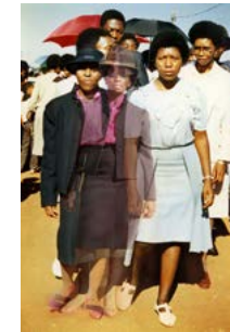
Re shapa setepe sa lenyalo II, 2013, Inkjet print on cotton rag paper, 42 x 29.7 cm, Edition of 5 + 2AP