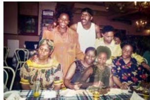
Re intshitse mosebetsing II, 2013, Inkjet print on cotton rag paper, 29.7 x 42 cm, Edition of 5 + 2AP