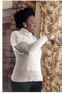
Moketeng wa letsatsi la tswalo la ho qala wa moradi waka I, 2013, Inkjet print on cotton rag paper, 42 x 29.7 cm, Edition of 5 + 2AP