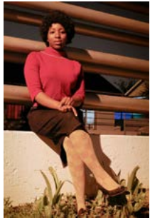
Kwana Germiston bosiu I, 2013 Inkjet print on cotton rag paper, 42 x 29.7 cm Edition of 5 + 2AP

Ke Lefa Laka: Her-story, 2013, Photography.