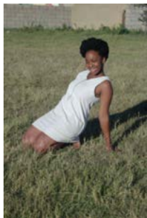
Ke dutse pela dipalesa I, 2013 Inkjet print on cotton rag paper, 42 x 29.7 cm Edition of 5 + 2AP