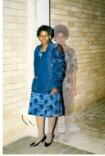
Ke tswa intsha ka thatohatsi yaka ya mose o botala ba lehodimo II, 2013, Inkjet print on cotton rag paper, 42 x 29.7 cm, Edition of 5 + 2AP

Ke Lefa Laka: Her-story, 2013, Photography.