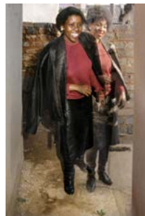
3-phisi yaka ya letlalo II, 2013 Inkjet print on cotton rag paper, 42 x 29.7 cm Edition of 5 + 2AP