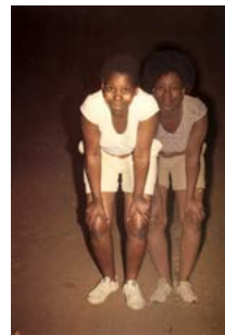
Ke tsamaya masiu II, 2013 Inkjet print on cotton rag paper, 42 x 29.7 cm Edition of 5 + 2AP