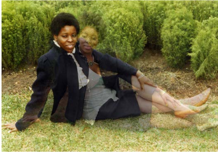
Ke Lefa Laka: Her-story, 2013, Photography

Ke Lefa Laka: Her-story, 2013, Photography.