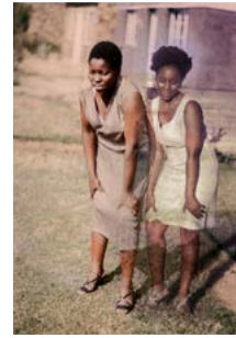
Ngwana o tshwana le dinaledi II, 2013 Inkjet print on cotton rag paper, 42 x 29.7 cm Edition of 5 + 2AP