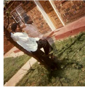
Sefateng khoneng II, 2013 Inkjet print on cotton rag paper, 42 x 42 cm Edition of 5 + 2AP