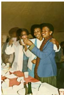
Moketeng wa letsatsi la tswalo la motswalle II, 2013, Inkjet print on cotton rag paper, 42 x 29.7 cm Edition of 5 + 2AP