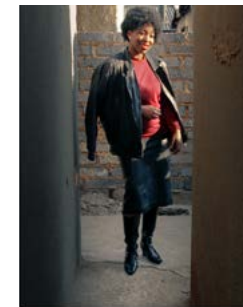
3-phisi yaka ya letlalo I, 2013 Inkjet print on cotton rag paper, 42 x 29.7 cm Edition of 5 + 2AP