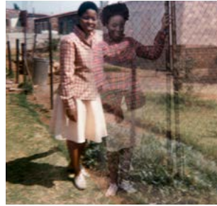
Hlakeng ya kereke II, 2013 Inkjet print on cotton rag paper, 42 x 42 cm Edition of 5 + 2AP