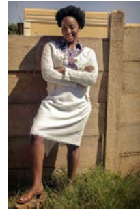
Ka mona leboteng la moahisane I, 2013 Inkjet print on cotton rag paper, 42 x 29.7 cm Edition of 5 + 2AP