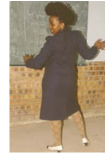
Re tantshetsa phaposing ya sekolo I, 2013 Inkjet print on cotton rag paper, 42 x 29.7 cm Edition of 5 + 2AP