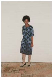
Ke tswa intsha ka thatohatsi yaka ya mose o botala ba lehodimo I, 2013, Inkjet print on cotton rag paper, 42 x 29.7 cm, Edition of 5 + 2AP