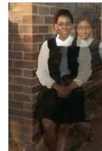
Ke eme ka diaparo tsa sekolo II, 2013 Inkjet print on cotton rag paper, 42 x 29.7 cm Edition of 5 + 2AP