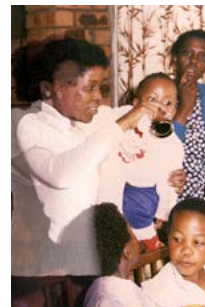
Moketeng wa letsatsi la tswalo la ho qala wa moradi waka II, 2013, Inkjet print on cotton rag paper, 42 x 29.7 cm, Edition of 5 + 2AP